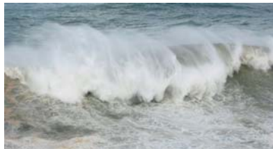
40-Foot Waves breaking at "The Point" in Haiku. Fo' real... Only these were a week later.

Armed complete with goggles on our faces so we could see through the water spray, we began paddling into 3-4 foot waves with a 20 foot head wind (typical North Shore Maui weather). 20 minutes later, we decided the original destination across the bay just wasn't going to make it happen, so we opted for a closer venue, a beautiful inlet, surrounded by palm trees and a black beach of lava rocks worked smooth by